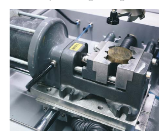
Pneumatic Clamping Device

An automatic diamond dresser keeps the grinding stone plane and sharp for optimum performance and precise results. The multi-pass grinding depth is monitored accurately with material height measurement system. Instead of relying on preparation time, the necessary amount of material to be removed can be specified with the shortest possible grinding time.