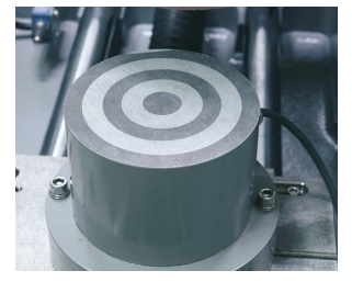
Electromagnetic Clamping Device