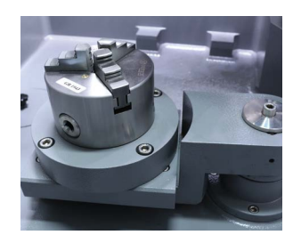
Mechanical 3-jaw Chuck

Spectral PG 52 is equipped with braking device permitting a rapid stop of the grinding wheel. The machine is fitted with an interlocking safety device not allowing the hood being opened before the grinding motor is stopped.