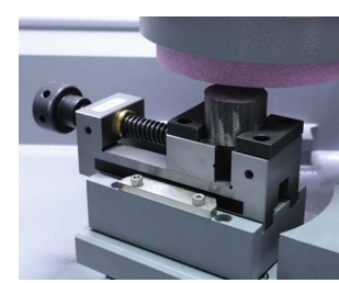
Mechanical Clamping Device