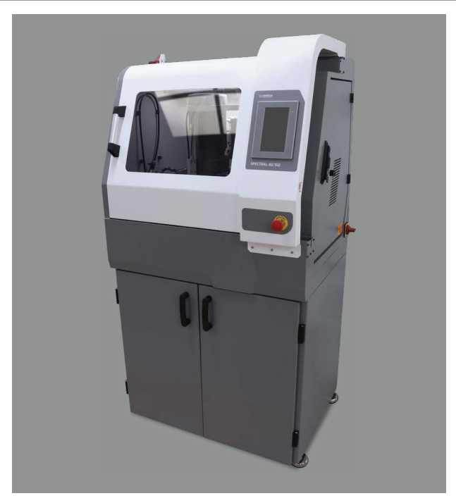
SPECTRAL AG 102 with cabinet