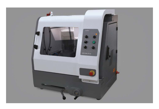
SPECTRAL PG 52 Grinding Machine