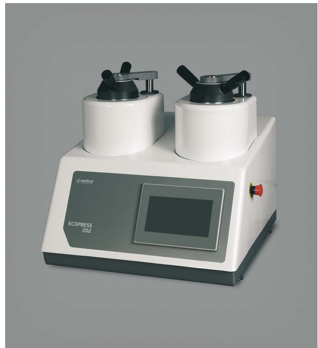
Ecopress 202, Automatic Mounting Press with Dual Cylinders

ECOPRESS 102/202 has additional capacity to store up to 99 operator-created programs. User-friendly program data and instructions are displayed on a large touch screen LCD.