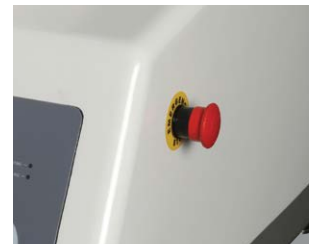
Emergency Stop for Operator Safety