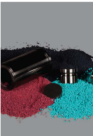
Mould cylinder, upper ram, lower ram