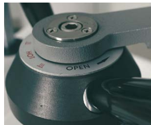
Insulated Mould Closure