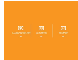
User Friendly Software