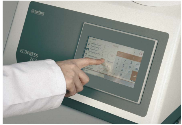
Easy and comfortable operation