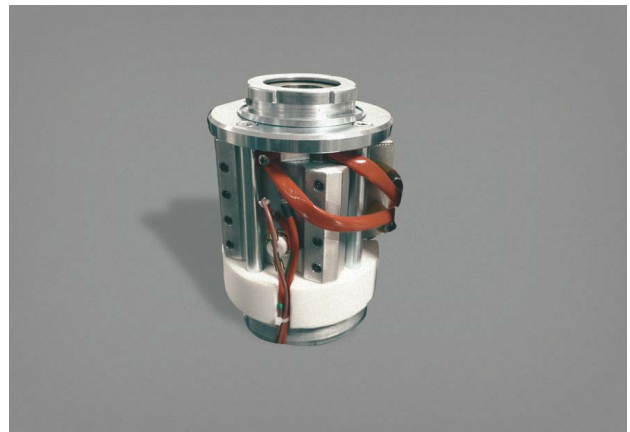
Powerful Heating Unit

The high efficiency combined heater/cooler is housed in the upper part of ECOPRESS. With 1650 W of thermostatically controlled heating power, molding times are kept to a minimum. At the end of the heating cycle, the cooling water is automatically switched on and will turn off once the "Cooling Temperature" is reached. When the stand-by mode is switched on, pre-warming maintains a constant ready to use temperature, thus reducing the cycle time. Three cooling modes are available as "Standard", "Slow" and "Based on Time". Slow cooling is for thermoplastic resins which require far longer cooling times for best mount clarity. A stainless steel "Recirculating Cooling Unit" is optionally available.