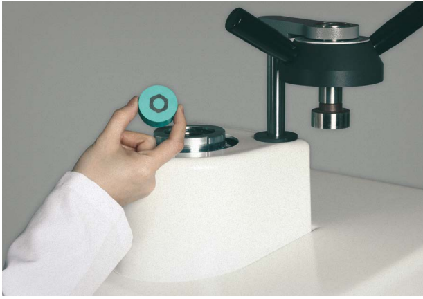
Consistent results with programmable parameters