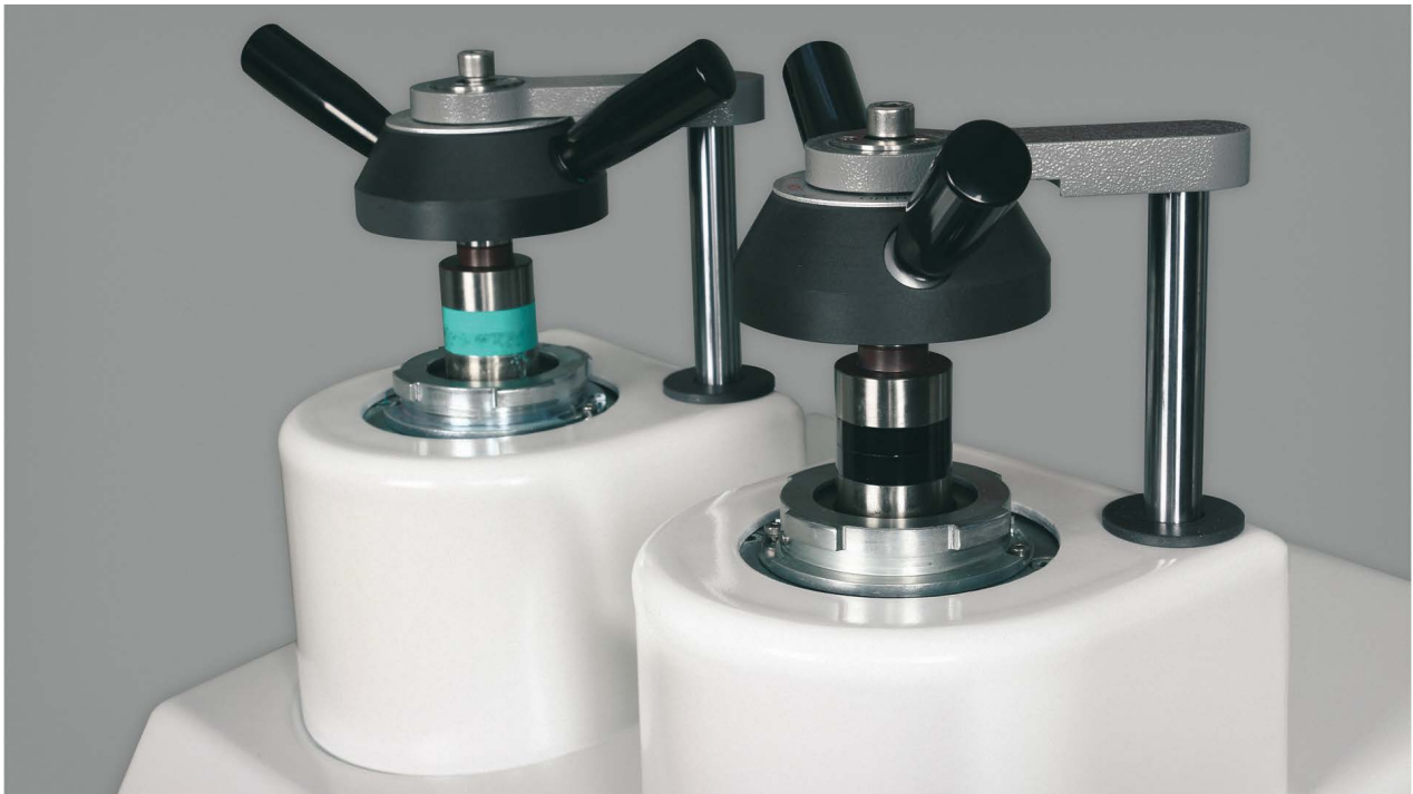
Ecopress 202, Perfect solution for laboratories with high specimen throughput

Allows to double your throughput with the included intermediate ram at the same cycle.