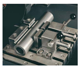
Stainless steel clamping devices and T-Slotted table