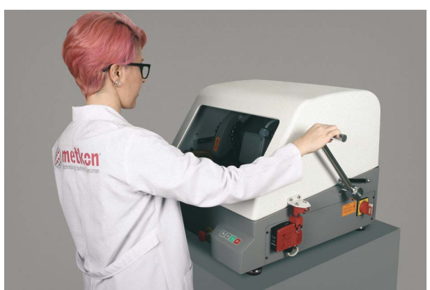
Ergonomic handle for fast cutting

The complete system is enclosed in a protective hood with a large shatter proof window to observe the cutting process. The cutting chamber inside is illuminated with a powerful LED.